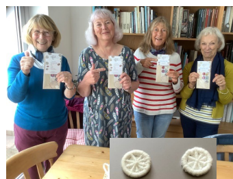
and of their finished buttons.

I split them into two groups of four, as per government guidelines at the time. Attached are photos of the first group