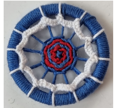
Top left: My version of Tudor Rose button.